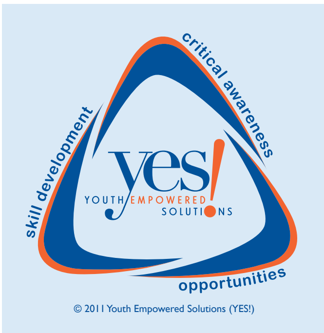
Figure 1: YES! Youth Empowerment Model

Research has shown that not only do youth benefit by aiding in the achievement of compassion, health, and mastery of decision-making skills, but adults and organizations do as well. 18 For example, adults and organizations become more connected and responsive to youth in the community, thus leading to programing improvements. 19 Adults gain satisfaction in passing on their knowledge and guidance to the next generation. Adults have the opportunity to experience the competence of youth firsthand and begin to perceive young people as legitimate, crucial contributors. Furthermore, a synergy becomes possible between youth and adults who are in different stages of their lives, and consequently have different interests, skills, and experiences to bring to the decision-making process and enhance and improve programming. 20 For these reasons adults discover the utility of youth empowerment and its role in creating more functional organizations and a more just society. Organizations and communities also benefit from this new mind-set of creating collaborative change and fully participating in a democratic process.